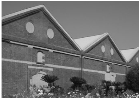
Dairi Flour Mill storehouses that are now used by Nikka Whiskey Distilling Co.'s Moji Factory (formerly Dairi Shusei Seizosho)