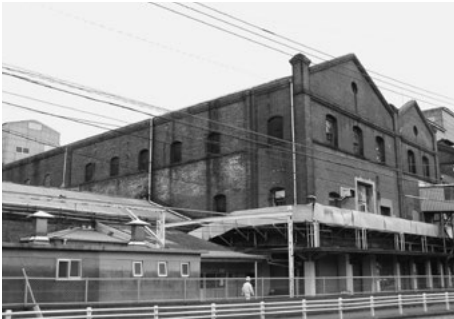
Present-day Kanmon Sugar Manufacturing Co. (formerly Dairi Sugar Manufacturing Co.)

*Kanmon Straits: The stretch of water separating the islands of Honshu and Kyushu.