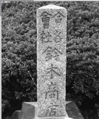
Landmark on the grounds of Shinko Metal Products facilities