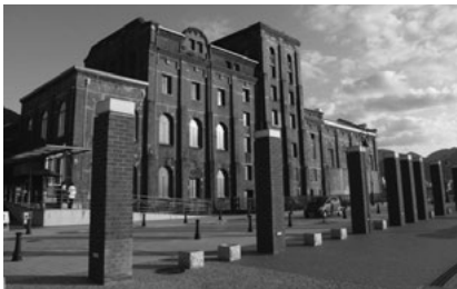
Kitakyushu Beer & Brick Museum, Moji Ward